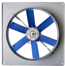
Elta Agri HXP Fan High efficiency fan designed to pass high volumes of air with minimum use of energy.