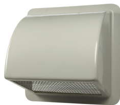
Wall Cowl with Bird Mesh Allows air intake whilst preventing inlet of other kinds (e.g. rain, birds).