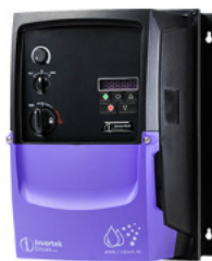
Inverter Controller Variable speed controller for use with 220V to 240V 1Ph 50Hz supply.